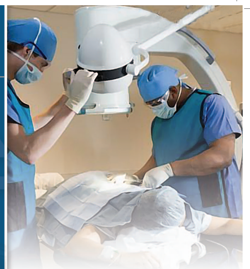
Mobile Economy Imaging Tables. The perfect combination of features & price. Simply the best value on the market.

EconoMAX 1 moves (up/down) EconoMAX 2 moves (up/down, lateral tilt) EconoMAX 3 moves (up/down, lateral tilt and trendelenburg) EconoMAX 4 moves (up/down, lateral tilt, trendelenburg and longitudinal travel)